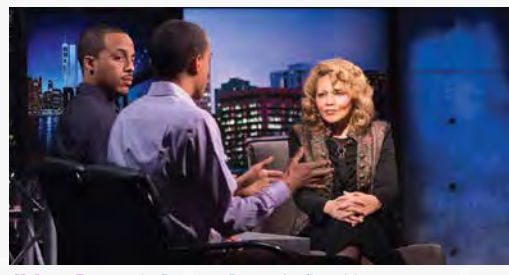
Urban Report is Dare to Dream's flagship program. featuring testimonies and a wide variety of topics